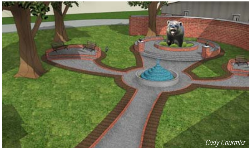
Artist's Depiction of Legacy Park

Complete and return the order form below along with payment of $30 per brick. For additional order forms go to www.lcmcisid.org and click on the LCM Foundation button under District Information. Capital letters at the beginning of words only. Messages will be centered automatically.